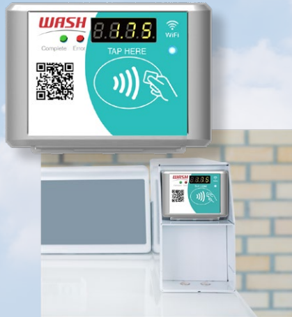
Mounted on machine exterior